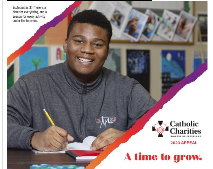
Ecclesiastes 3:1 There is a time for everything, and a season for every activity under the heavens.