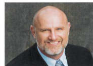
Elvis Grbac Retired NFL quarterback and motivational speaker.

OUTSTANDING MUSIC • SACRAMENT OF RECONCILIATION • MASS Continental Breakfast and Lunch