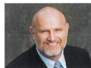
Elvis Grbac Retired NFL quarterback and motivational speaker.

OUTSTANDING MUSIC • SACRAMENT OF RECONCILIATION • MASS Continental Breakfast and Lunch